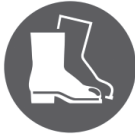
Wear safety footwear