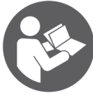
Refer to instruction manual

IMPORTANT: PLEASE READ THESE INSTRUCTIONS CAREFULLY. NOTE THE SAFE OPERATIONAL REQUIREMENTS, WARNINGS & CAUTIONS. USE THE PRODUCT CORRECTLY AND WITH CARE FOR THE PURPOSE FOR WHICH IT IS INTENDED. FAILURE TO DO SO MAY CAUSE DAMAGE AND/OR PERSONAL INJURY AND WILL INVALIDATE THE WARRANTY. KEEP THESE INSTRUCTIONS SAFE FOR FUTURE USE.